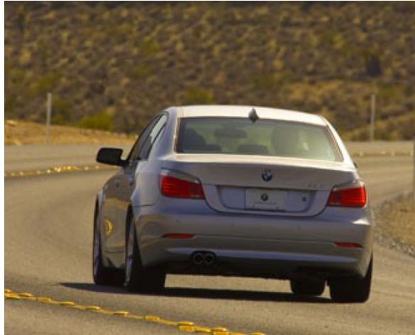
2.4 minutes of cruising at 50 mph