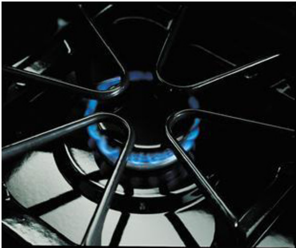
2.6 hours on a natural gas burner (3414 Btu)