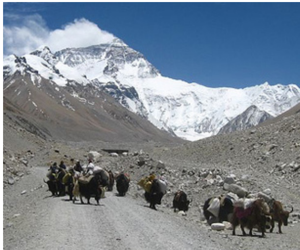
Carrying a 90lb. pack from sea level to 29,000 ft. (Mt. Everest)