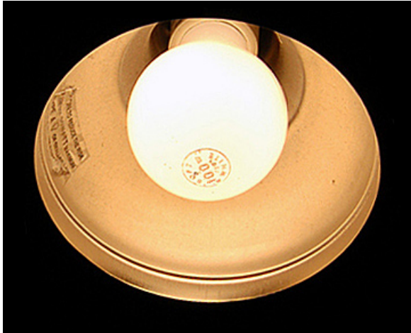
10 hours of burning a 100W light bulb